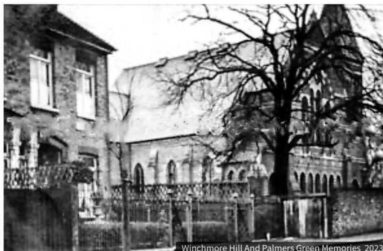
Winchmore Hill And Palmers Green Memories 2023

Any suggestions about a date? When was Ingleby Court constructed?